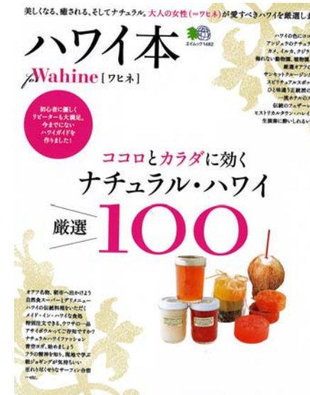
Wahine Bon “Women’s Guide”