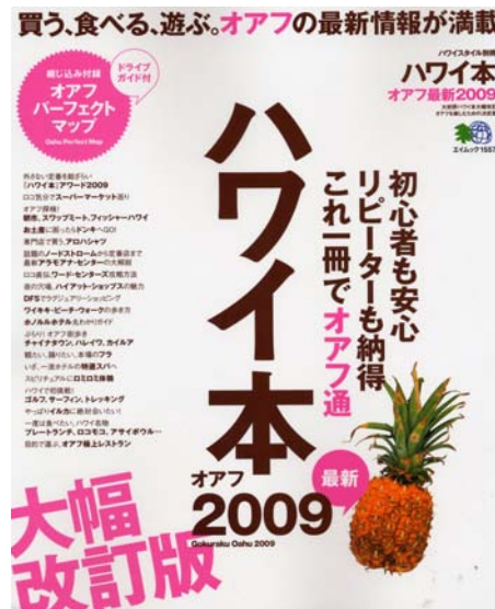
Hawaii Bon “Hawaii Book”