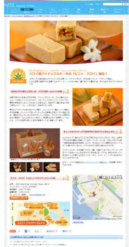
▲ Pina Hawaii Standard Advertorial