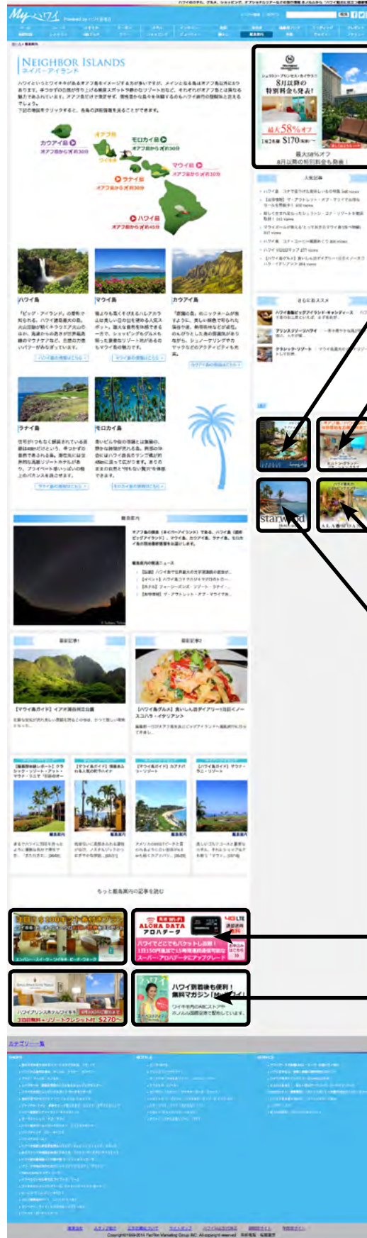
Spot Special 2 (All Pages)

- Subject to Hawaii general excise tax. (4.712%)