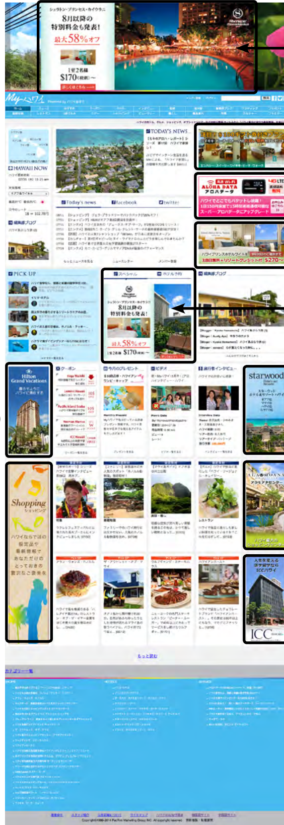
Spot Special 1 (Top Page Only)

- Subject to Hawaii general excise tax. (4.712%)