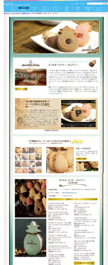
▲ Honolulu Cookie Company Premium Advertorial