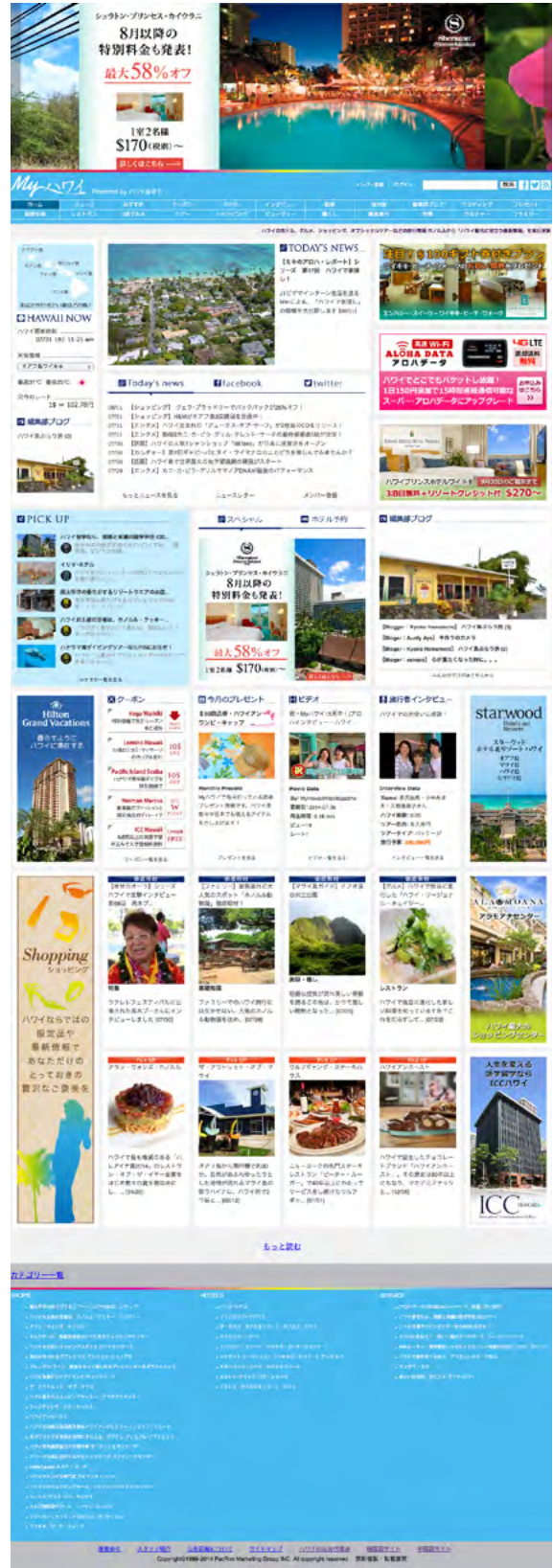
▲ Top Page