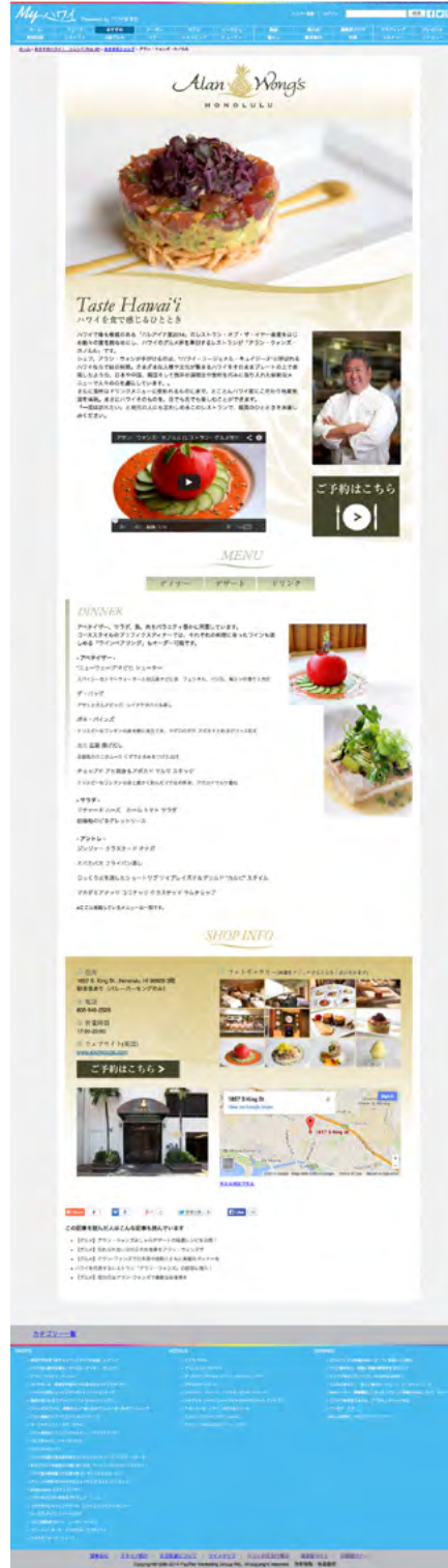
▲ Alan Wong's Standard Advertorial