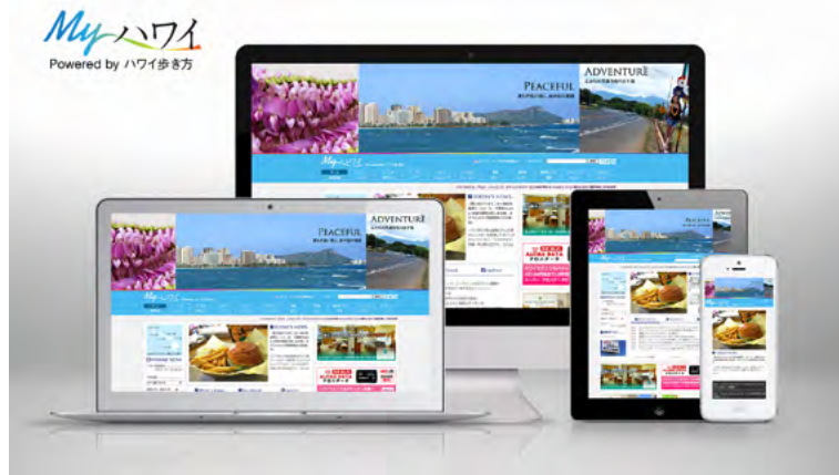
▲ New Responsive Web Design - Designed with optimized viewing for PC, Tablet and Mobile devices.