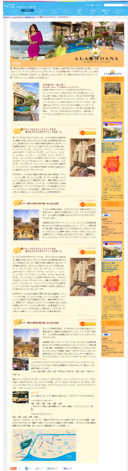
▲ Ala Moana Center Premium Advertorial